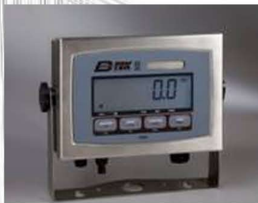
T103S Indicator Shown