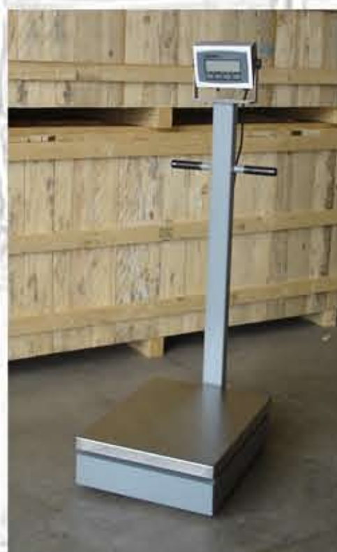
24" x 18" Weigh-A-Round (Optional) Swivel Casters 48" Column w/ handle grips