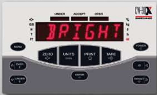
Display contrast can be easily adjusted to suit any environment