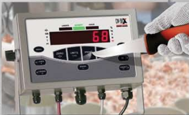
The tough piezo keypad offers exceptional durability, unaffected by sharp knife points or other abrasive treatment.